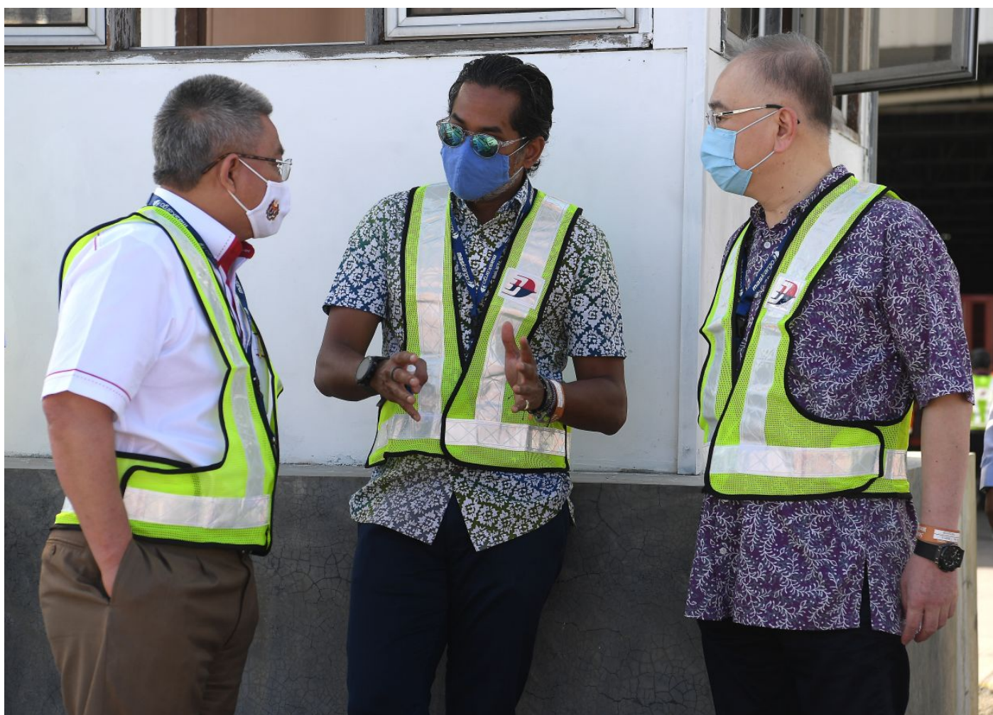
(From left) Health Minister Datuk Seri Dr Adham Baba, Khairy and Transport Minister Datuk Seri Dr Wee Ka Siong at KLIA to witness the arrival of the first batch of Covid-19 vaccines on Sunday (Feb 21, 2021).

PETALING JAYA: The National Covid-19 Immunisation Program will begin two days ahead of schedule on Wednesday (Feb 24).